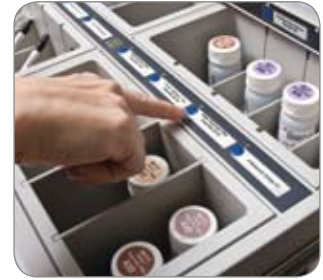
The Cubex System supply drawers are ideal for storing small items.