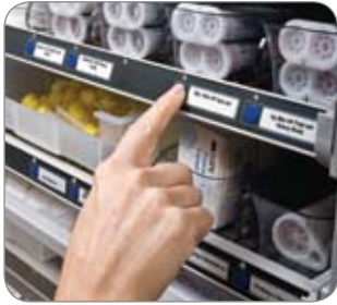
Users press the button for the item and inventory levels are tracked.

Managing inventory is a constant challenge affecting all areas of your practice. The Cubex System maximizes efficiency of supply management through proven technology designed to control supply costs while providing automated inventory tracking and replenishment.